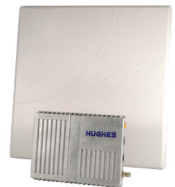
BGAN modem + satellite antenna