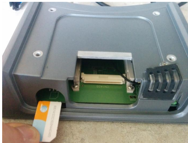
Figure 1: GX400 with cover removed