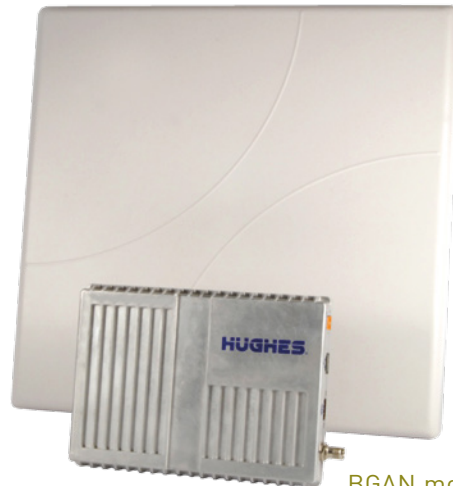
BGAN modem + satellite antenna