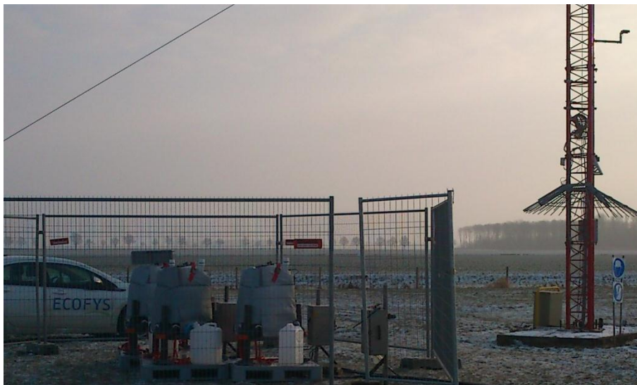
LiDAR will soon be part of the IEC standard for power curve measurements [Project reference: ZephIR ZP300 Verifications at Test Site Lelystad, 2013]

An improved power curve measurement method is now being implemented [9] that considers the “equivalent wind speed” across the whole rotor disk. This will mean that wind resource assessments for future wind turbines will go up to the upper tip-height, further justifying LiDAR measurements.