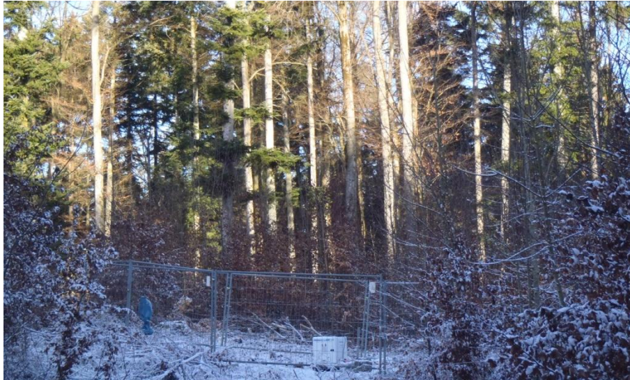
LiDAR can help characterise site conditions, including shear in forests allowing for proper wind turbine selection [Project reference: Horb am Neckar, 2012]