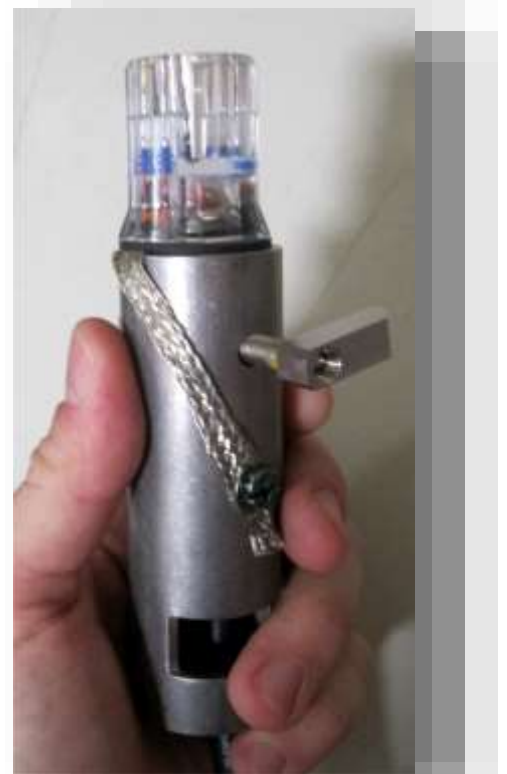
Figure 1 | Completed stub mount & cable assembly.

Remove or loosen the stainless ground screw. Create an opening in the braided shield of the cable and thread the screw through the shield, then tighten back to the stub mount.