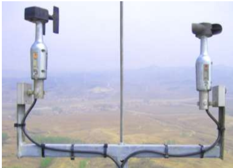
Figure 2 | Hybrid XT sensors installed on the met mast of a G4X turbine