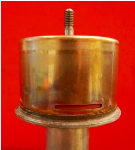
Minor corrosion, working heater