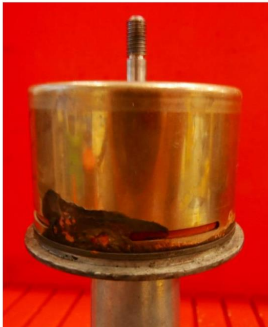
Minor corrosion, working heater