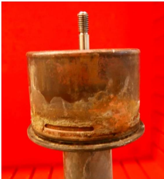
Excessive corrosion, failed heater