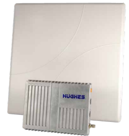
BGAN modem + satellite antenna